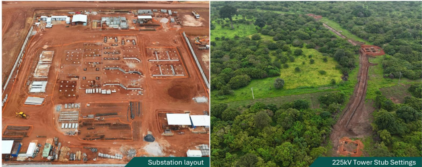
Figure 7: Electrical substation and high-voltage grid connection preparation