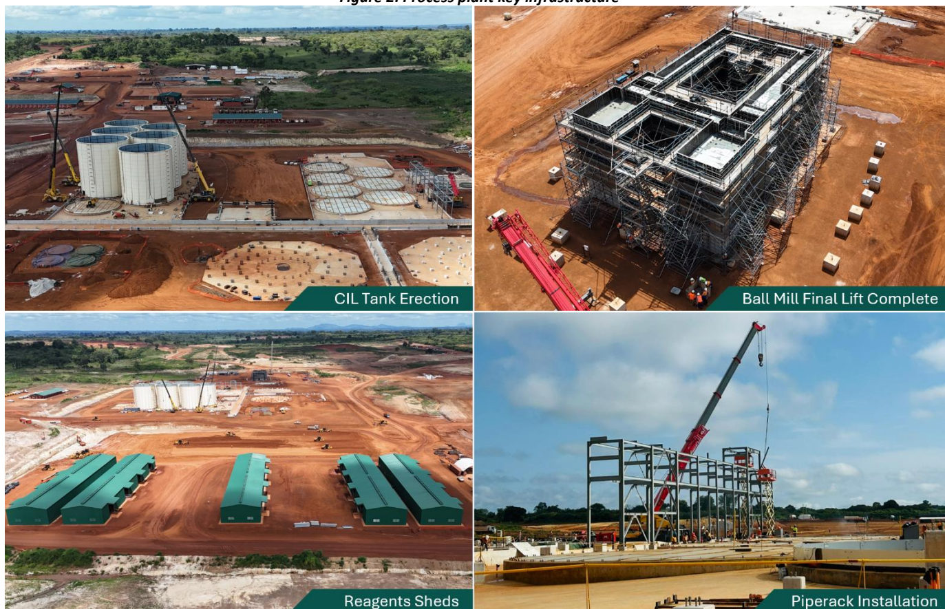
Figure 2: Process plant key infrastructure