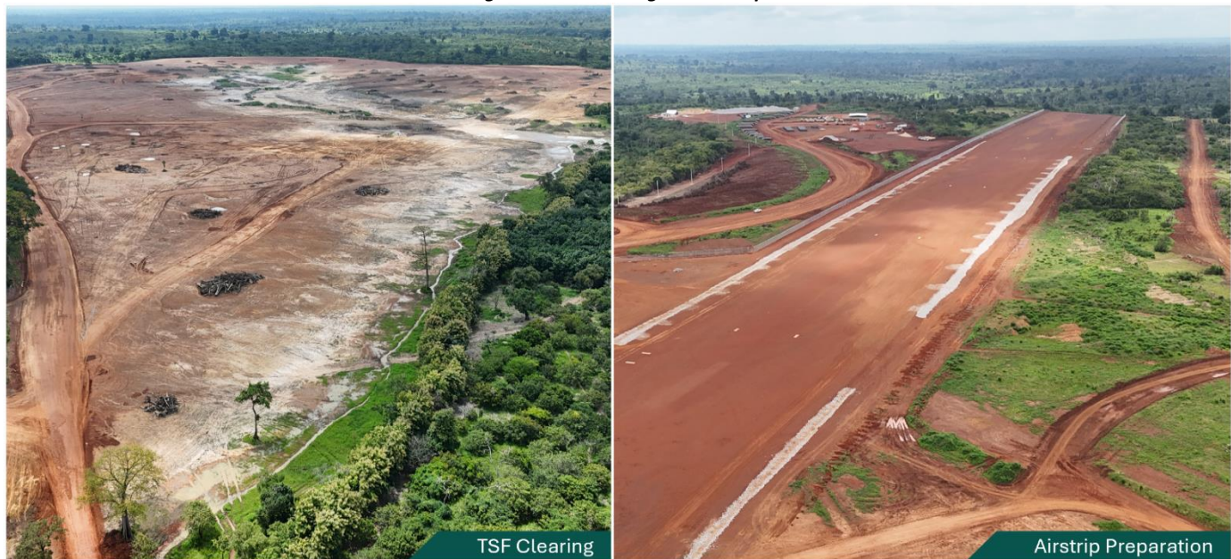
Figure 8: TSF clearing and airstrip