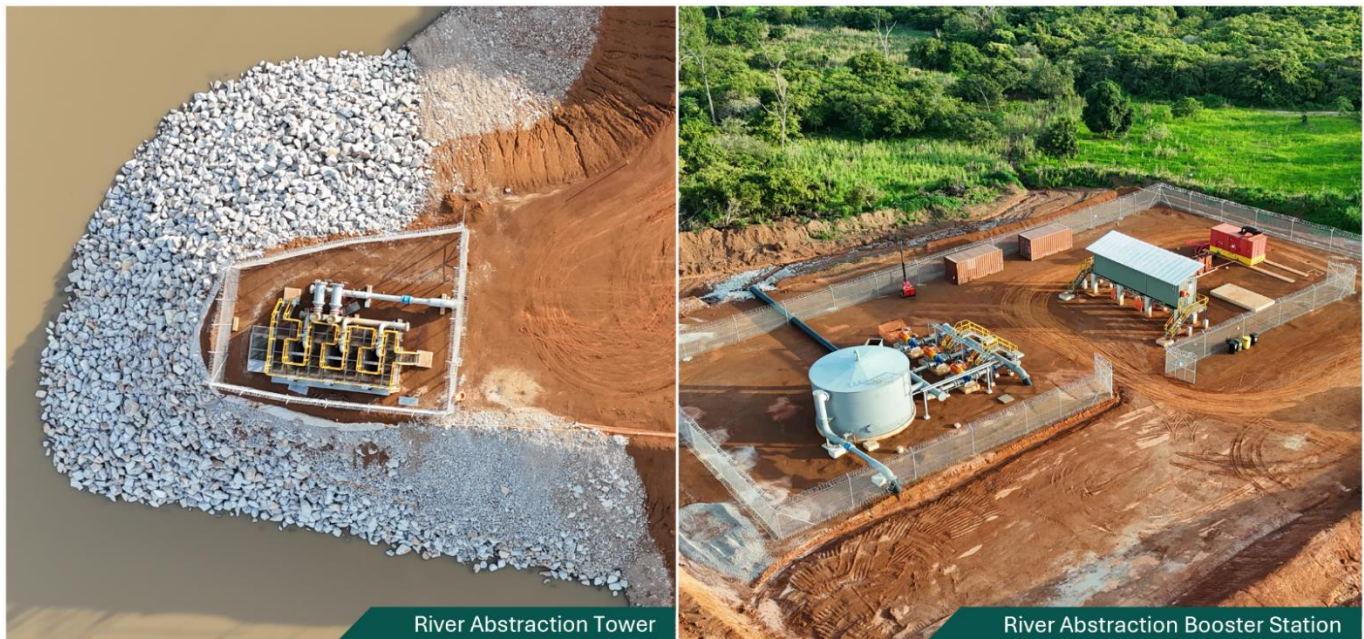
Figure 5: River abstraction site and pumping infrastructure