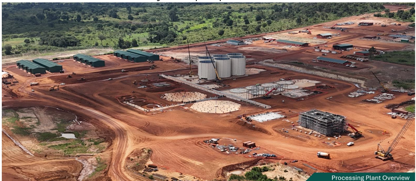
Figure 1: Koné process plant overview

Together with the key design enhancements made last year, these initiatives provide opportunities to unlock significant value for all stakeholders as we continue to deliver on our construction schedule."