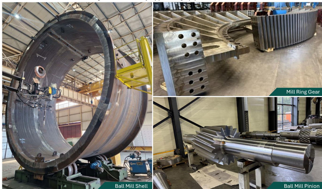
Figure 4: Fabrication of key processing equipment and steel

› Owner mining operating model adopted following a comprehensive review and competitive tender process of both owner-operated and contractor mining models. The owner-operated mining model is underpinned by a long-term contractual agreement with Neemba International Limited (“Neemba”), the Caterpillar dealership for 11 countries in West Africa, including Côte d’Ivoire, with fleet acquisition and mobilisation costs financed through a $75.0 million Equipment Finance Facility (as detailed in the section below). The owner-operated mining model is expected to provide greater mine planning flexibility, improve operating efficiencies, and aligns with Montage’s commitment to developing local talent through training programmes as evidenced with a number of tasks being self-performed during the construction phase. Furthermore, the owner-operated mining model is expected to enable the swift integration of higher-grade satellite deposits into the production schedule, with mine planning frequently optimized to incorporate new expected higher-grade discoveries.