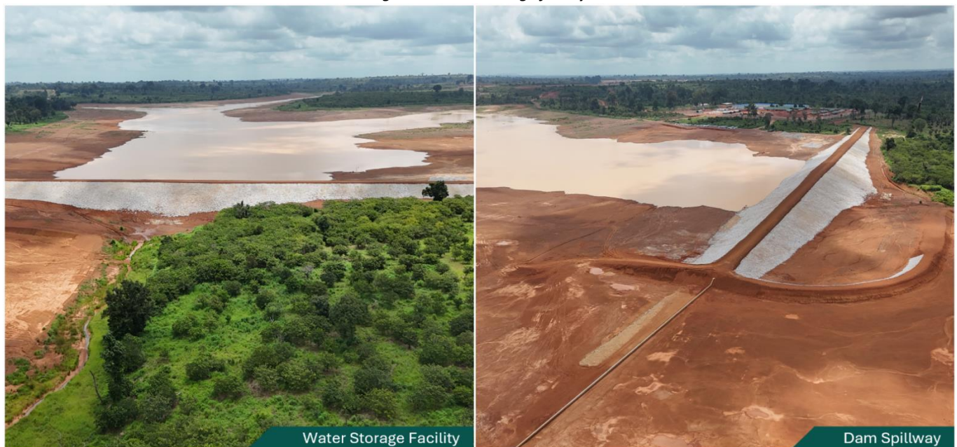
Figure 6: Water storage facility